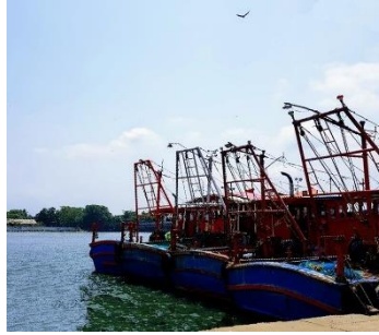
Fishing vessels in Neendkara Port, Kerala