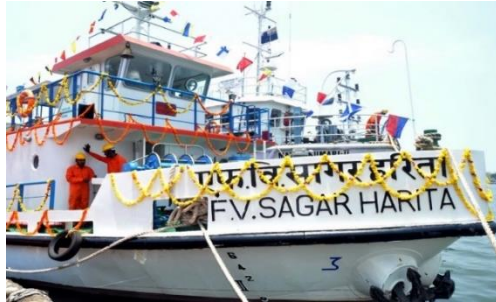
Fuel consumption measurement systems used onboard of research vessels