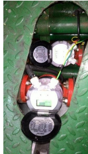
High-accuracy fuel flowmeters