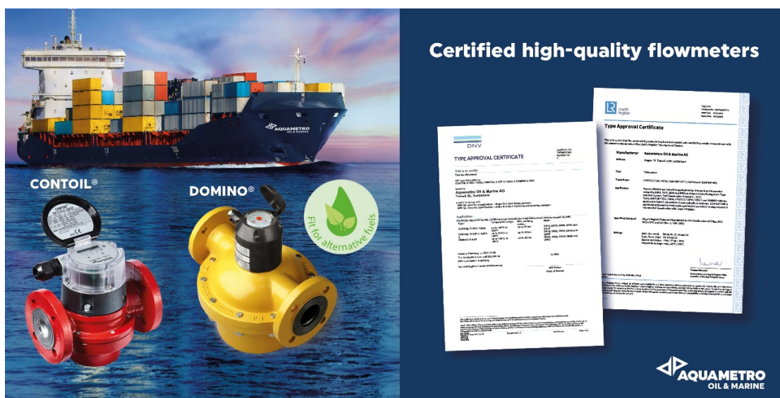
Pic. 1: Type Approval Certificates issued by DNV and LR.

The Type Approval Certificates are applicable for our flowmeters with type designations CONTOIL ® VZO/VZOA, CONTOIL ® VZF II/ VZFA II and DOMINO ® ARD. These flowmeters are accepted for installation on all DNV and LR class-typed vessels. The Type Approval Certificates are valid until 2025.